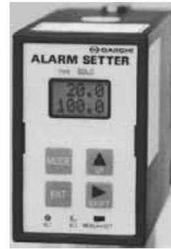
SDDV-105 (80 × 50 × 133mm/380g)

A compact plug-in setter for instrumentation. The device inputs two DC signals, calculates deviation between inputs and deviation of each input, compares the results with preset signal, then outputs the over-and-short. Because the device is software compatible, besides full scale of input can be set at will in accordance with process quantity, each setting value (operation value, moving average constant, contact delay, etc) can be set and changed freely as well. Also, input (actual scale) and each setting value can be displayed by a LCD (with back light) in 4 digits.